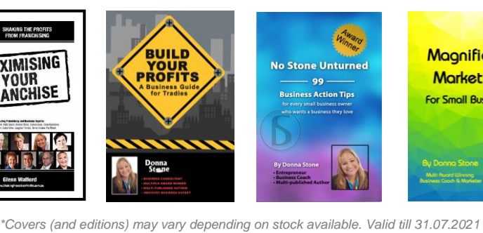
2<sup>nd</sup> Edition *