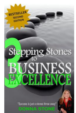
2 nd Edition *

*Covers (and editions) may vary depending on stock available. Valid till 31.12.2014